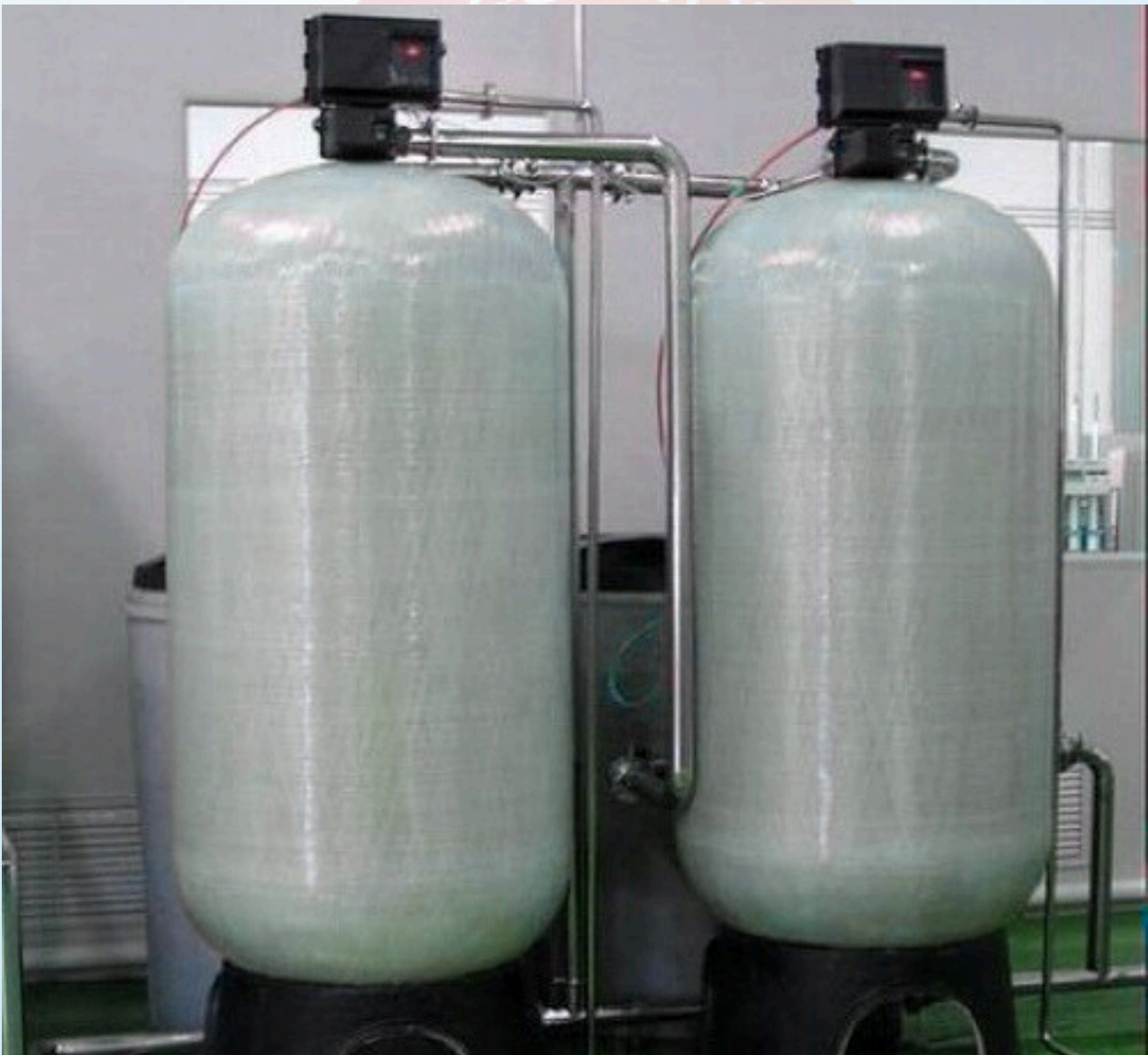
Water Softening Plant

COEQUAL INFOTECH PVT LTD delivers high-performance Water softeners tailored to meet your specific needs. Our systems not only protect your equipment from scaling but also ensure operational efficiency, cost savings, and long-term reliability. Whether for a boiler, cooling tower, or general industrial use, trust us for a continuous supply of high-quality Water Softening Plant.